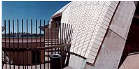
Fig 7 The six images after stitching

The advantage of doing it this way is that you can use almost any camera to photograph a scene. The disadvantage is that you have to employ a lot of computing grunt to make it happen. Hence the fast PowerPC.