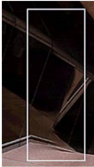
Fig 9 The white box encloses a stitch 'failure'

On a PowerPC this step requires 20 MB of RAM and takes 3 minutes. On 68k machines it takes eight times longer(!).