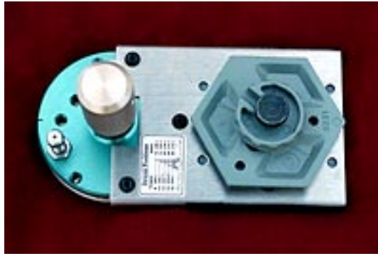
Fig 2 Kaidan QP-1A Base with Manfrotto quickmount plate

required when setting up on-site is the leveling of the tripod head.