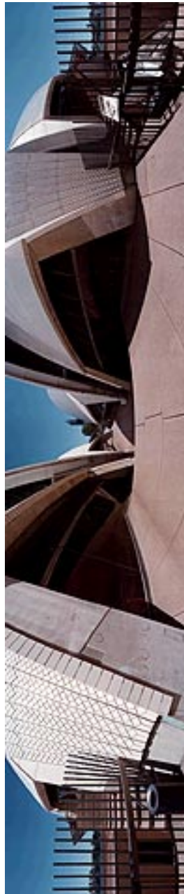
Fig 8 The final 360 degree stitched panorama

For the dicing step to work properly - as well enable your movies to be playable across platforms - you must make certain that the height of the panorama is exactly divisible by 96 and its width exactly by 4. In addition, if the height is not exactly divisible by 24 then you will get a dicing error and then you will have to re-stitch (or go back to Photoshop) to re-scale the image.