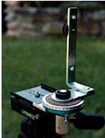
Fig 3 Kaidan QP-1A base and (custom) 35mm bracket