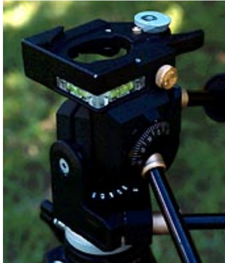
Fig 1 Tripod head with double spirit levels