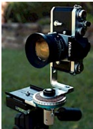
Fig 4 Full Quicktime VR rig with camera and 24mm lens