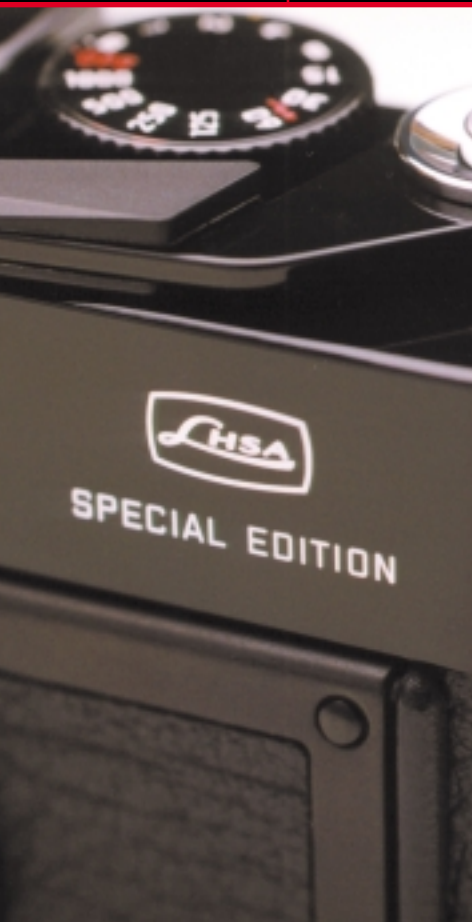
DISCRETELY ENGRAVED LHSA LOGO ABOVE THE WORDS SPECIAL EDITION

There is probably no model of the Leica that both collectors and users agree about more wholeheartedly as being the most desirable than the black paint M cameras of the 50s and 60s. Be it an MP, M3, M2 or M4, these models have always had a special appeal. The brass underneath the paint gives a warmer feel to the metal and the paint also reflects the light differently than black chrome. It also shows the classic Leica engravings in a different way; the black is deeper and the white engravings are brighter and the camera has a certain glow to it.